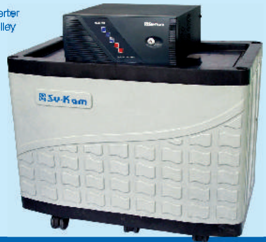
MAK - Digital Inverter With Chetak Trolley